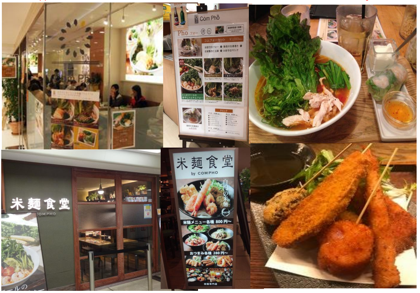
The side dishes menu is enhanced at the "Komemen Shokudo by COM Pho" (米麺食堂 by コムフォー) Otemachi outlet

■ Strategy: Mango Tree Kitchen is a similar concept. It serves Thai dishes such as "Gapao Rice" and "Khao Man Gai", and has expanded to a commercial building next to the Naka station. Komemen Shokudo by Com Pho (米麺 コムフォー) has outlets in Otemachi and Ikebukuro to extend their reach to a wider customer base. They plan to expand further and attract more health-conscious customers with their gluten-free and signature pho soup.