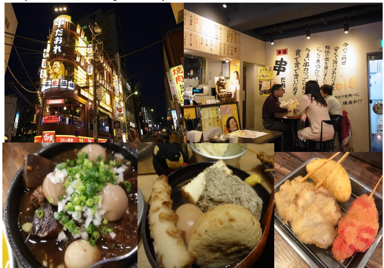
The Shibuya Sakuragaoka outlet opened in April 2018. It is a large and outstanding-looking store with 150 seats over 2 floors.

There are 45 types of skewers on the menu that are commonly found in izakayas, e.g. "Kushi-age" (串揚げ), "Kushi-yaki" (串焼き) and "Kushi tempura" (串天ぷら) priced between ¥150 to ¥180; and other lowly-priced novel items such as Camembert and Billiken (tako yaki). They also served 15 kinds of oden cooked in dashi broth, Beef and egg stew (牛どて玉煮) at ¥380, and "Chicken Nanban shibatsuke with tartare sauce" (鶏唐南蛮 シバ漬けタルタルソース) at ¥480. It is a Japanese-style izakaya patronized by office workers, middle-aged and elderly customers.